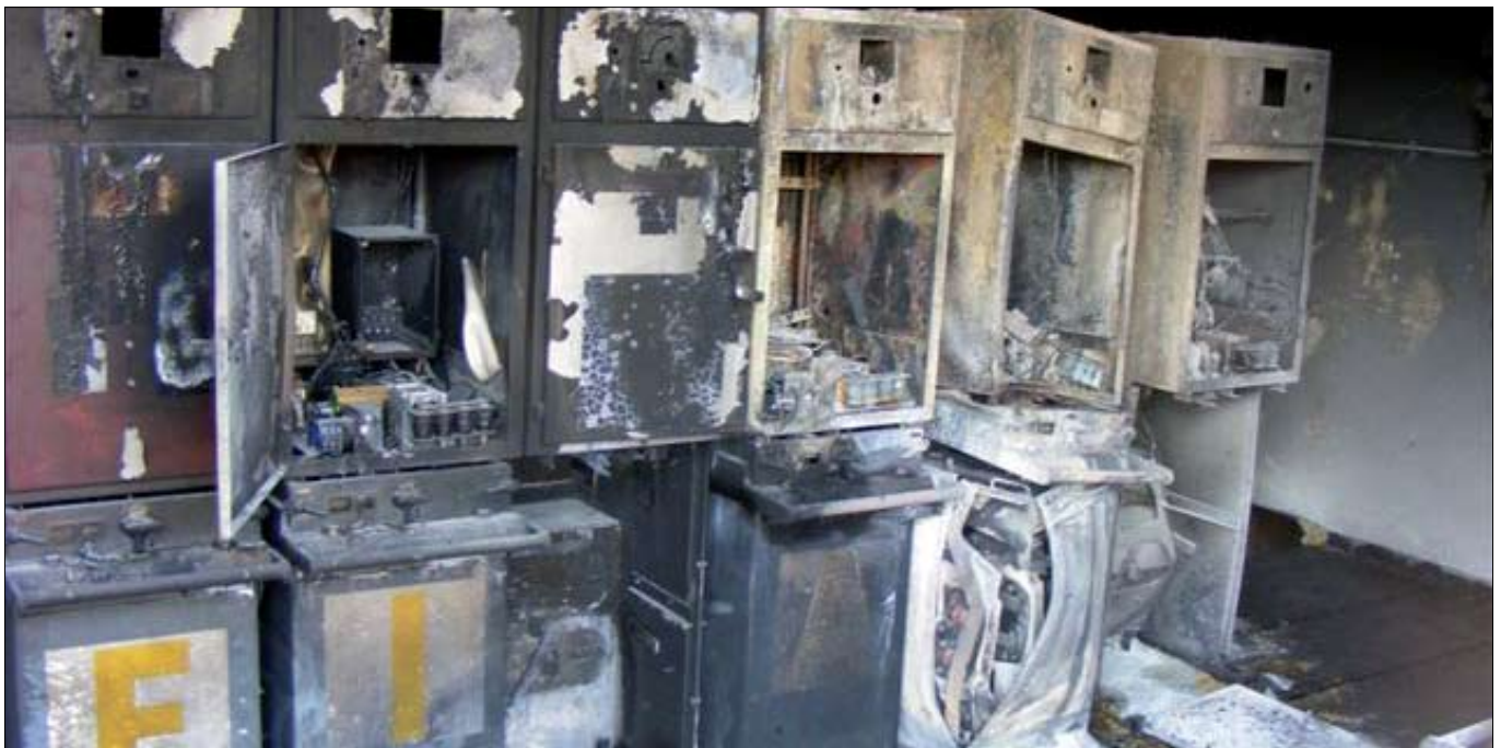
An example of an installation where a Risk Based Inspection program (RBI) was not put in place.

To assist clients who are considering replacing switchgear High Voltage Solution (HVS) has developed an on-site audit process called Risk Based Inspection program (RBI) which combines a number of disciplines to rank clients' switchgear into low / medium / high risk groups. Note: this can be also be applied to cables.