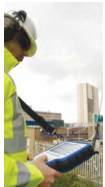
RFI survey being taken of a switchyard

By walking around the HV switchyard using a hand-held RFI instrument to take measurements, sources of PD and external interference can be detected and identified. The instrument searches for PD in the radio frequency area; harmful PD will reveal itself by the electromagnetic energy emitted from the area where the activity is. By recording the electromagnetic energy in the RF spectrum, the recorded information can be analyzed and decisions for remedial actions can be made. Once repairs are complete a re-survey is undertaken to compare the previous RF spectrum with the current RF spectrum, thus insuring the fault has been rectified.