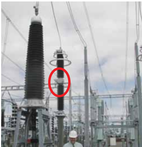
Location of fault (PD) in red circle

If undetected, it can lead to costly repairs and eventually complete electrical breakdown of HV apparatus; thus, testing for PD is an important part of a condition based maintenance (CBM) program for HV apparatus.