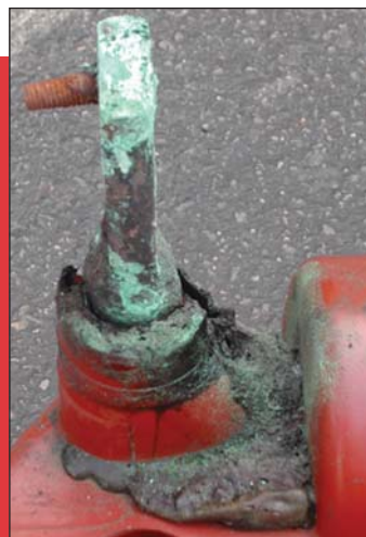
A typical fault