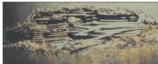
Example of a failed dry type transformer winding

Though the customer did not share specifics, it indicated the lost productivity figures – in terms of dollars – were significant.